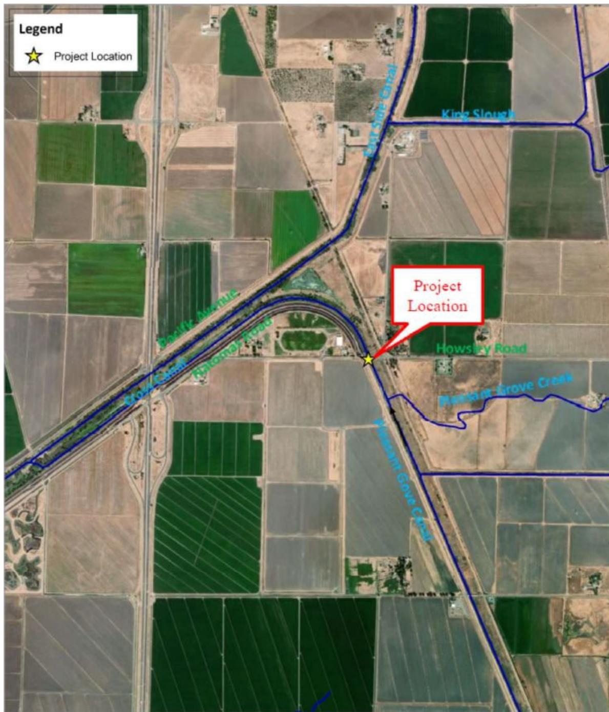
2) Proposed project location map